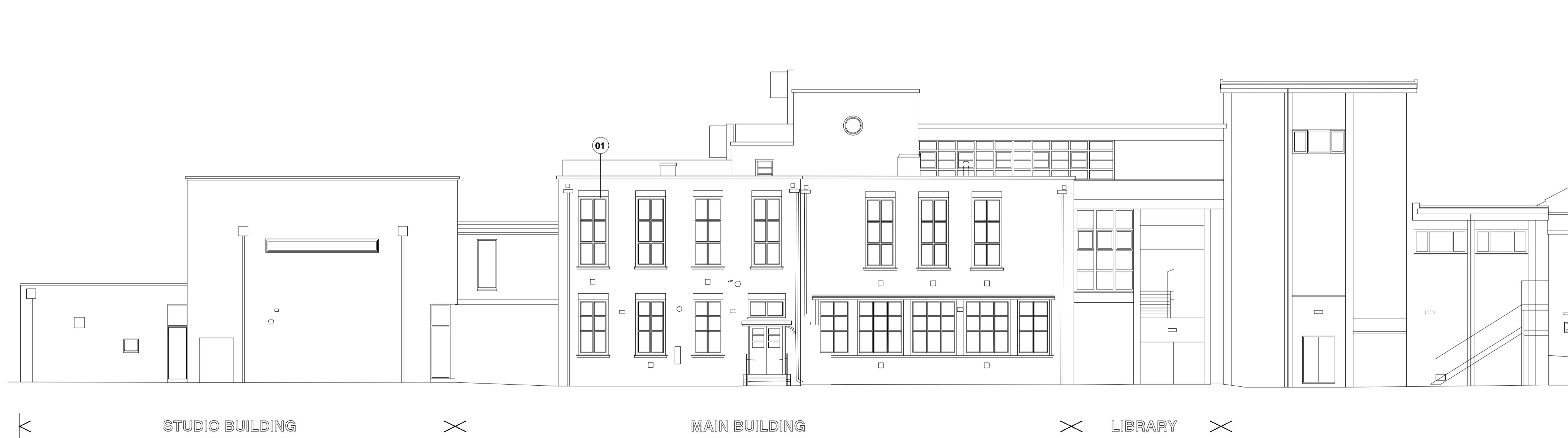
2 Main Building - Elevation D 1.125