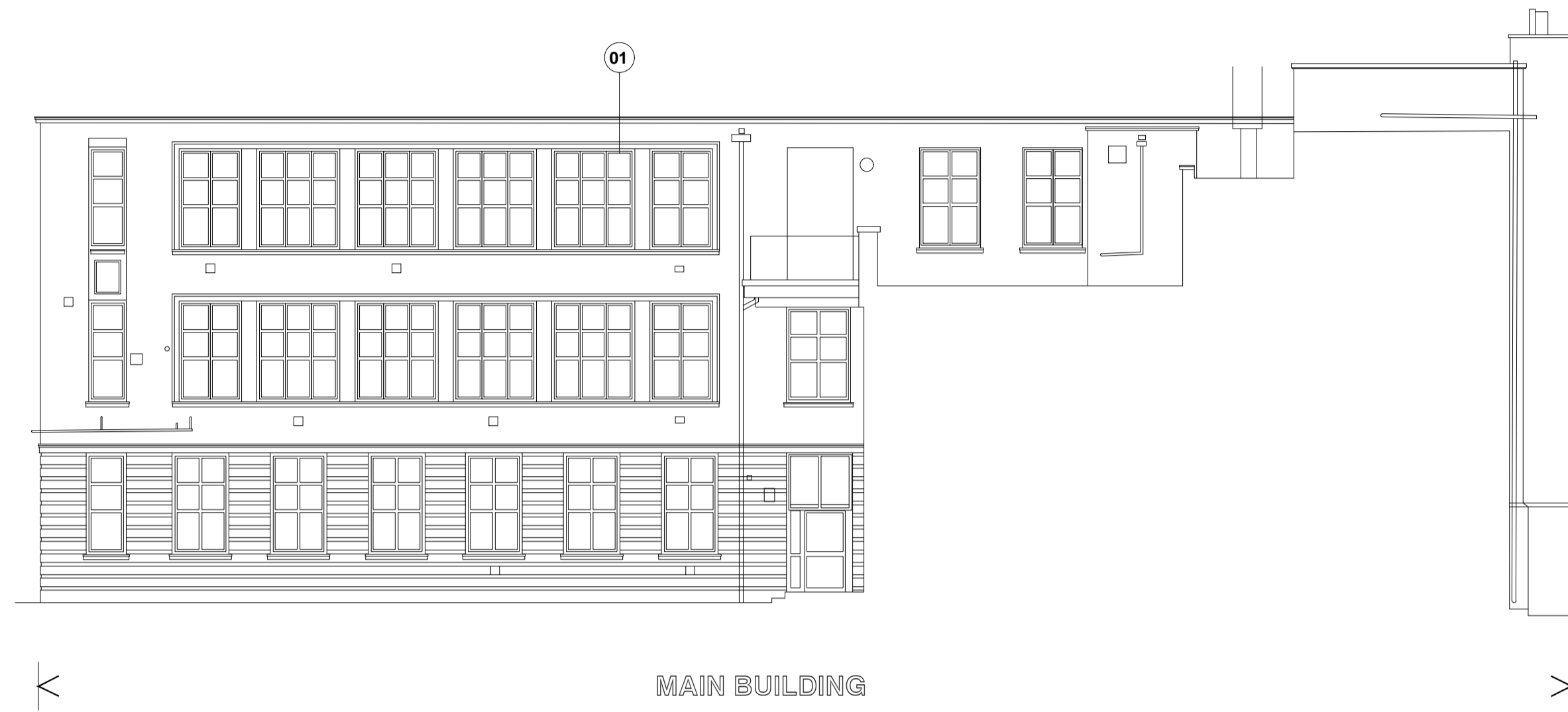
1 Main Building - Elevation C 1.125